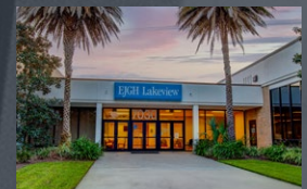
LAKEVIEW MEDICAL New Orleans, LA 21,619 SF - Medical Clinic Closed 5/19/2022