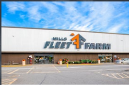
FLEET FARM Stevens Point, WI 170,642 SF Closed 1/19/2022