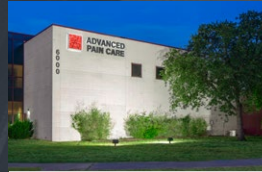
ADVANCED PAIN CARE Austin, TX 12,480 SF • Medical Clinic Closed 1/15/2021