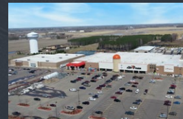
FLEET FARM, CAMBRIDGE Cambridge, MN 174,603 SF Closed 5/4/2022