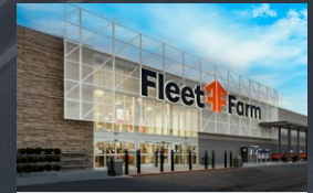
FLEET FARM, WAUKEE Waukee, IA 187,834 SF 3/1/2022