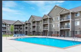
THE GROVE AT MANKATO Mankato, MN 524 Units Closed 4/28/2021