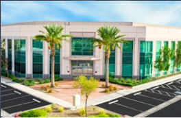
CENTENNIAL HILLS MEDICAL CENTER Las Vegas, NV 57,156 SF • Medical Clinic Closed 1/13/2021