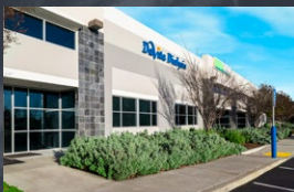
LAGUNA WEST Elk Grove, CA 49,616 SF - Medical Clinic Closed 5/12/2022