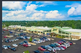
RIVERSIDE CROSSING Greer, SC 58,358 SF Closed 4/13/2022