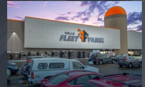
FLEET FARM, FLAGSHIP STORE Appleton, WI 431,440 SF Closed 6/21/2021