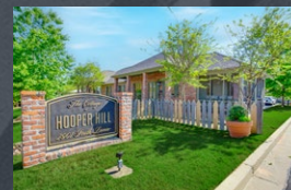
COTTAGES AT HOOPER HILL Oxford, MS 81 Beds Closed 6/8/2022