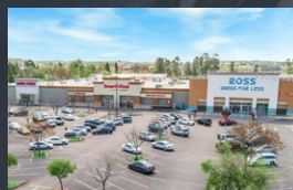
FEATHER RIVER CROSSING Oroville, CA 90,580 SF Closed 12/21/2021