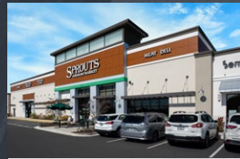
TAMAYA MARKET Jacksonville, FL 61,695 SF Closed 2/11/2022