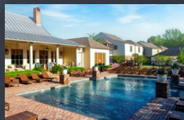
COTTAGES AT HOOPER HOLLOW Oxford, MS 280 Beds Closed 6/8/2022