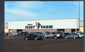
FLEET FARM, MENOMONIE Menomonie, WI 150,900 SF Closed 5/4/2022