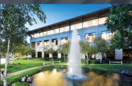
PARKSHORE PLAZA Folsom, CA 271,476 SF Closed 10/08/2021