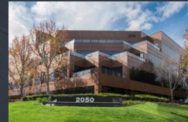
GRAMERCY PLAZA Torrance, CA 158,376 SF Closed 6/11/2021