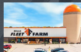
FLEET FARM Brooklyn Park, MN 246,891 SF Closed 10/26/2021