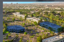
KB RIDGE ROUTE, LLC Laguna Hills, CA 66,082 SF Closed 10/7/2022