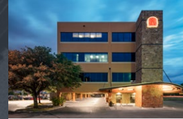
ADVANCED PAIN CARE Round Rock, TX 28,384 SF • Medical Clinic Closed 1/15/2021