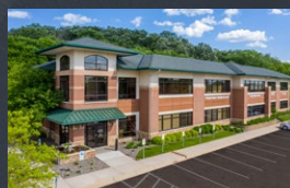
CARMICHAEL MEDICAL BUILDING Hudson, WI 26,517 SF • Medical Clinic Closed 10/12/2021