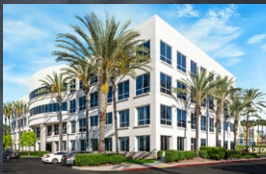
STADIUM CROSSINGS Anaheim, CA 106,068 SF Closed 3/14/2022