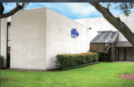
PORT ARTHUR MEDICAL Port Arthur, TX 38,466 SF • Medical Clinic Closed 7/12/2021