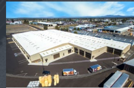
MURRAY ROAD Bend, OR 114,893 SF Closed 2/15/2022