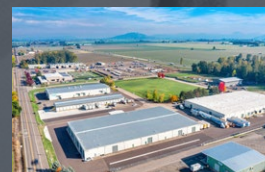
TANGENT LOGISTICS CENTER Tangent, OR 518,900 SF Closed 12/28/2021