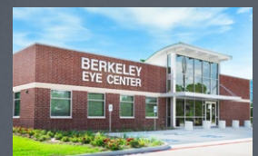
BERKELEY EYE CENTER Humble, TX 7,097 SF • Medical Clinic Closed 11/02/2021