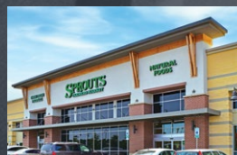
SHOPS AT TRINITY PARK Simpsonville, SC 44,424 SF Closed 12/21/2021