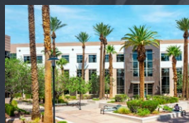
GREEN VALLEY CORPORATE CENTER, SOUTH Henderson, NV 163,356 SF Closed 9/8/2022