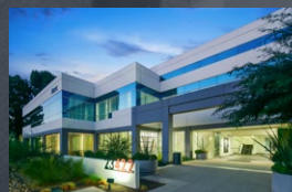
MILL CREEK OFFICE CAMPUS Laguna Hills, CA 228,380 SF Closed 10/7/2022