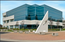
OLYMPUS CORPORATE CENTRE Roseville, CA 196,467 SF Closed 3/25/2021