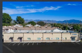
FRESENIUS KIDNEY CARE Arleta, CA 10,075 SF • Medical Clinic Closed 8/30/2021