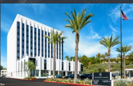
FULLERTON TOWERS Fullerton, CA 233,182 SF Closed 11/24/2021