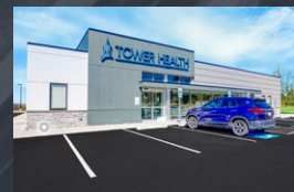
TOWER HEALTH Womelsdorf, PA 11,000 SF Closed 5/19/2022