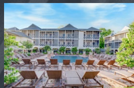
ARBORS AT THE PARK Oxford, MS 340 Beds Closed 6/8/2022