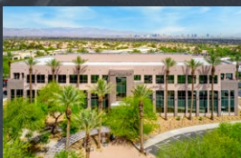
GREEN VALLEY CORPORATE CENTER, NORTH Henderson, NV 170,983 SF Closed 7/26/2022