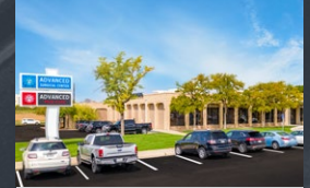
ADVANCED PAIN CARE Amarillo, TX 26,830 SF • Medical Clinic Closed 3/19/2021