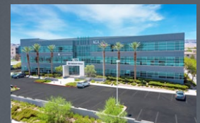
CITYWEST COMMONS Las Vegas, NV 67,415 SF Closed 7/14/2022