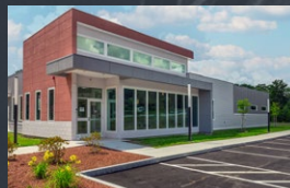
ACCESS SURGERY CENTER Auburn, NH 7,704 SF • Medical Clinic Closed 8/20/2021