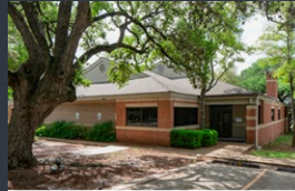
ADVANCED PAIN CARE Austin, TX 5,372 SF • Medical Clinic Closed 1/15/2021