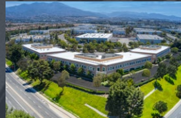
PALM TERRACE Lake Forest, CA 155,795 SF Closed 6/1/2021