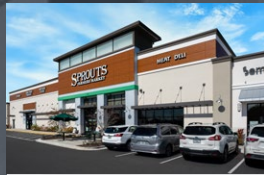
TAMAYA MARKET Jacksonville, FL 61,695 SF Closed 2/11/2022