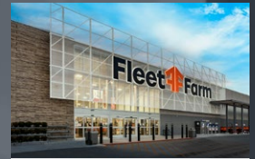
FLEET FARM, WAUKEE Waukee, IA 187,834 SF 3/1/2022