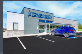
TOWER HEALTH Womelsdorf, PA 11,000 SF Closed 5/19/2022