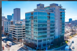
WAYSTAR Louisville, KY 128,000 SF Closed 5/19/2022