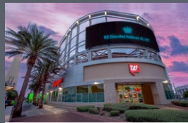
WALGREENS Las Vegas, NV 18,100 SF Closed 5/19/2022