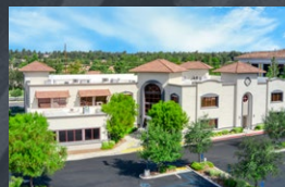
REDHAWK MEDICAL CENTER Temecula, CA 32,471 SF • Medical Clinic Closed 10/20/2021