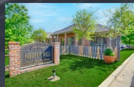
COTTAGES AT HOOPER HILL Oxford, MS 81 Beds Closed 6/8/2022