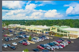
RIVERSIDE CROSSING Greer, SC 58,358 SF Closed 4/13/2022