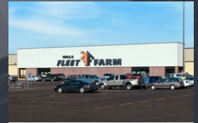
FLEET FARM, MENOMONIE Menomonie, WI 150,900 SF Closed 5/4/2022