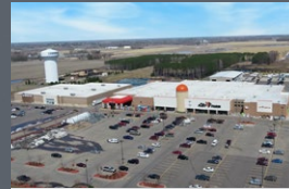
FLEET FARM, CAMBRIDGE Cambridge, MN 174,603 SF Closed 5/4/2022