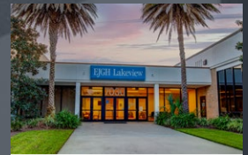
LAKEVIEW MEDICAL New Orleans, LA 21,619 SF - Medical Clinic Closed 5/19/2022