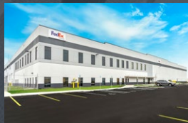
FEDEX GROUND DISTRIBUTION CENTER Bowling Green, OH 250,956 SF Closed 4/5/2023