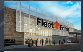
FLEET FARM, WAUKEE Waukee, IA 187,834 SF 3/1/2022