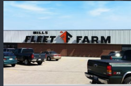
FLEET FARM Green Bay, WI 240,397 SF Closed 2/08/2022