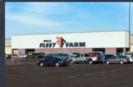
FLEET FARM PORTFOLIO Upper Midwest 328,575 SF Closed 5/4/2022