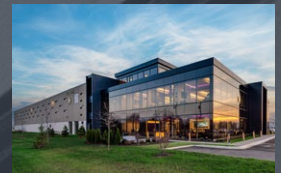
GOLDCOAST LOGISTICS HEADQUARTERS Elgin, IL 61,888 SF Closed 9/26/2023