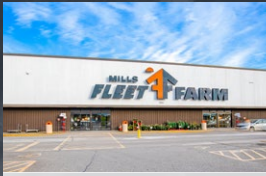
FLEET FARM Stevens Point, WI 170,642 SF Closed 1/19/2022