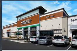
TAMAYA MARKET Jacksonville, FL 60,900 SF Closed 2/11/2022