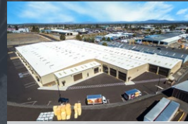
MURRAY ROAD Bend, OR 114,893 SF Closed 2/15/2022