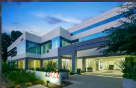
MILL CREEK OFFICE CAMPUS Laguna Hills, CA 228,323 SF Closed 10/7/2022