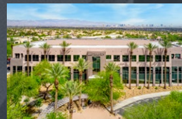
GREEN VALLEY CORPORATE CENTER, NORTH Henderson, NV 170,983 SF Closed 7/26/2022