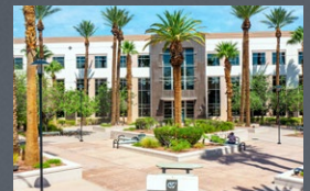
GREEN VALLEY CORPORATE CENTER, SOUTH Henderson, NV 163,356 SF Closed 9/8/2022