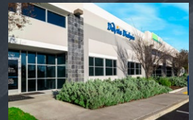
LAGUNA WEST Elk Grove, CA 48,257 SF • Medical Clinic Closed 5/12/2022