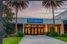
LAKEVIEW MEDICAL New Orleans, LA 21,619 SF • Medical Clinic Closed 5/19/2022