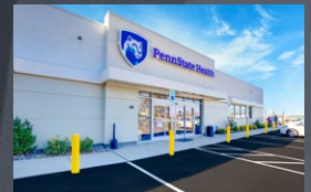
PENN STATE HEALTH Temple, PA 14,200 SF • Medical Clinic Closed 5/19/2022