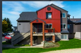
DUCKS VILLAGE STUDENT HOUSING Eugene, OR 245,100 SF Closed 1/24/2023