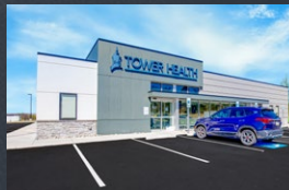
TOWER HEALTH Womelsdorf, PA 11,000 SF Closed 5/19/2022