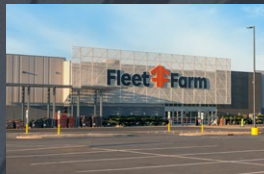
FLEET FARM, SIOUX FALLS Sioux Falls, SD 191,978 SF Closed 4/20/2022