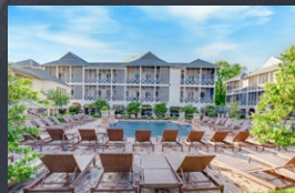
ARBORS AT THE PARK Oxford, MS 340 Beds Closed 6/8/2022